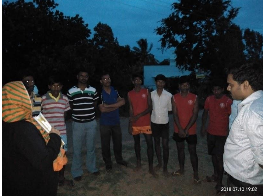
Academics of Regional Centre Chennai interacting with Scheduled Tribes youth