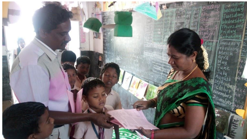
The local Panchayat leader were made involved to take IGNOU Programmes among the Panchayat level schools