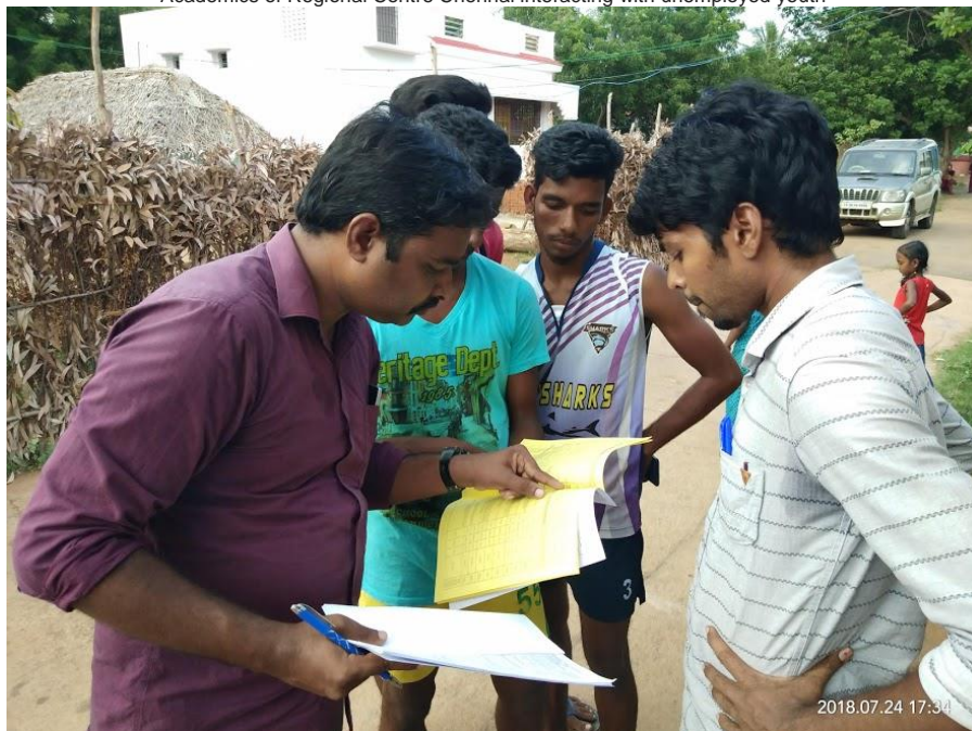
Rural youth are selecting the programmes on offer for interaction with Academics of Regional Centre