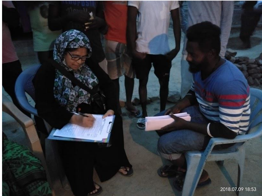
Academics of Regional Centre Chennai given career counselling to Scheduled Castes youth