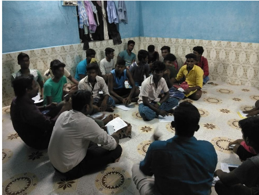
Academics of Regional Centre Chennai interacting with unemployed youth